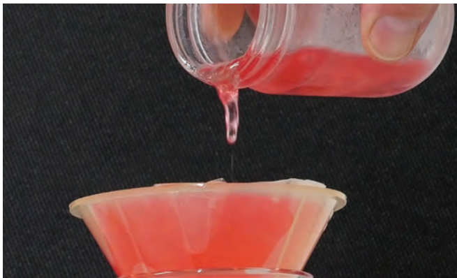
Wax formation in untreated diesel fuel resists pouring.

lowers the cold filter-plugging point (CFPP) by up to 40°F (22°C) in ULSD.