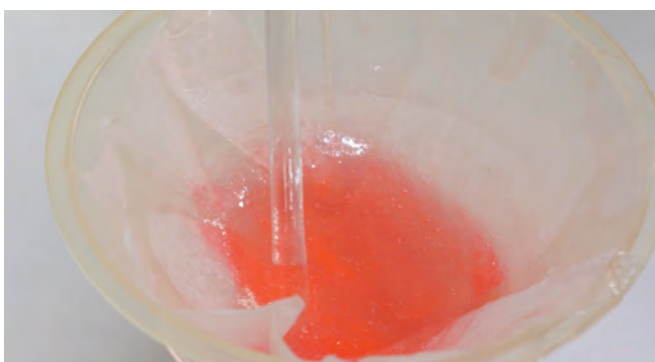
Wax formation in untreated diesel fuel plugs a coffee filter.