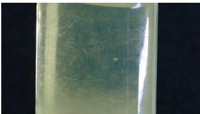
Wax crystals in untreated diesel fuel. The wax crystals will eventually fall out of solution and plug the fuel filter.